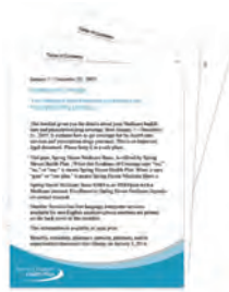
EVIDENCE OF COVERAGE (EOCs)