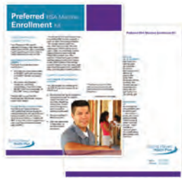
MEMBER ENROLLMENT AND WELCOME KITS