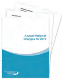
ANNUAL NOTICE OF CHANGE (ANOCs)

The types of member communications we provide include: