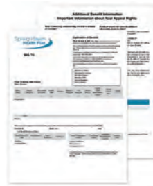
EXPLANATION OF BENEFITS (EOBs)