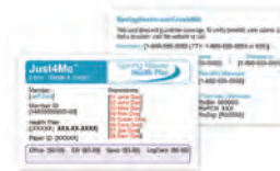
MEMBERSHIP ID CARDS