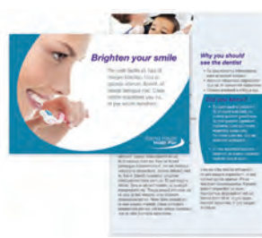
DISEASE AND WELLNESS MATERIALS